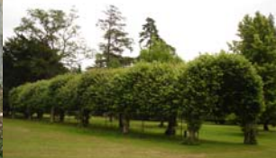
Tunnel in the Pinetum