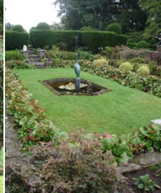
Wyndcliffe—statue and pool