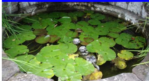
Wyndcliffe—dipping pool + otters