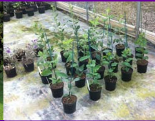
Potting for next year

several hundred years. This was a fascinating and eclectic exhibition.