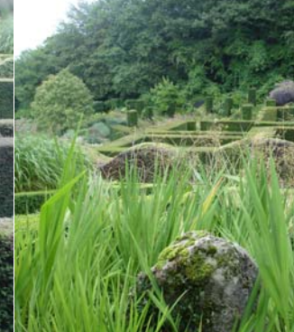
Veddw—hedges and grasses

planting. Behind the house is the vegetable garden and orchard.