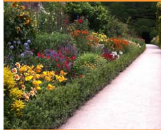
Hot coloured beds