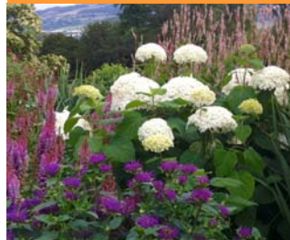
Cool coloured beds