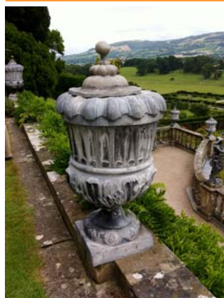
View from Terrace