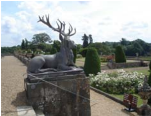
The Upper Terrace