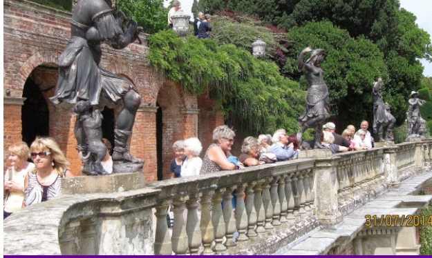
Members enjoying the view

In what looked like an old keep, but had been in fact part of the residential area of the building, we discovered the benefit of the earl's generous act of handing over the Castle to the National Trust lock stock and barrel, with furniture and artefacts going back