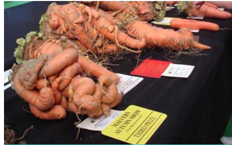
Giant carrots and leeks

We loved the picturesque setting of the show ground. There was so much to enjoy, particularly the giant curly chrysanthemums and the monster vegetables. The gun dog race trials were fun and the tea and cake in the vintage teashop. The flying display was spectacular It was good and the weather was superb – more like a very good day in July,