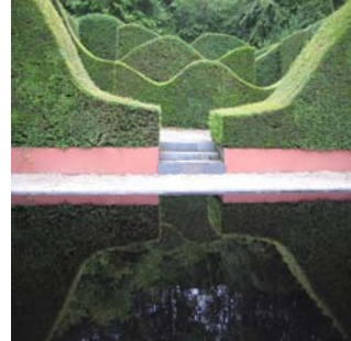
Pool and hedges

The most dramatic surprise of the garden is the reflecting pool with its black dyed water and pink, wave-form bench reached by a zigzag