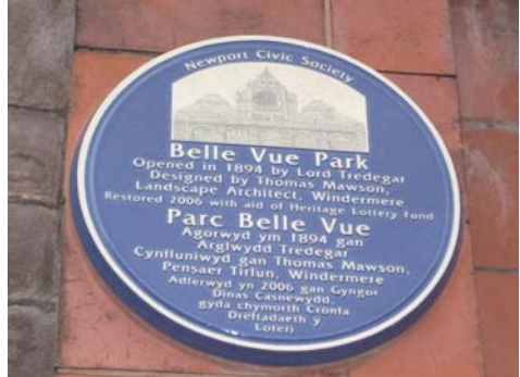
Belle View Park