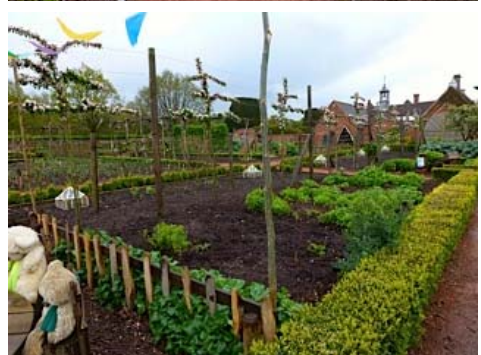
Packwood House and gardens