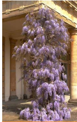
Wisteria at the front of Dyffryn House.

The Edwardian design and planting are the legacy of a unique and close collaboration between Dyffryn's owner plantsman Reginald Cory and landscape architect Thomas Mawson in the early twentieth century. Before the NT took over the gardens a grant from the Heritage Lottery Fund was given to Vale of Glamorgan council to reinstate large parts of the gardens at Dyffryn including replacing the enormous and dilapidated glasshouse. This year we shall be