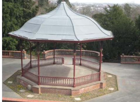
Band stand at Belle Vue Park with views over the Bristol Channel