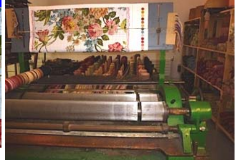
Carpet woven for the shrine of