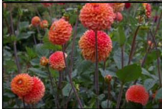
Rodmartin Manor Garden