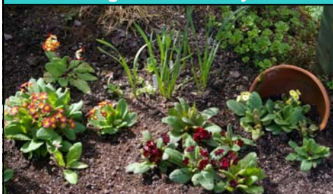
Blaencwm garden—and Dylan

After a greatly enjoyable hour rain fell so we scuttled back to our coach.